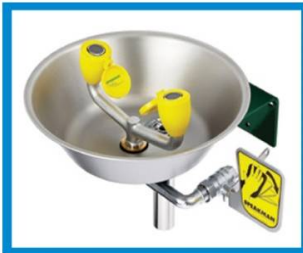
Eye/Face Wash Basin Model: LSE 1B