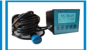
Online DO Controller