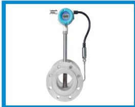
Vortex Flow Meter