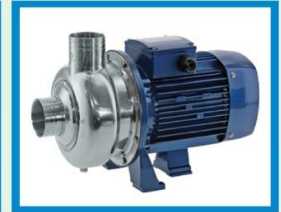
Chemical Transfer Pump