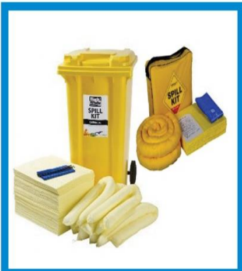
Universal Chemical Spill Kits