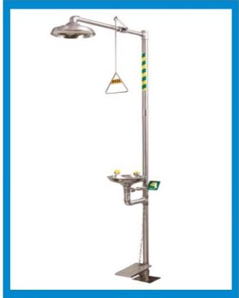
Emergency Safety Shower Model: LSE 7/8

Application: Widely used in Chemical Industry, Textile Manufacturing Company Pharmaceuticals and where Processing Chemical. Brand: Unicare Origin: India