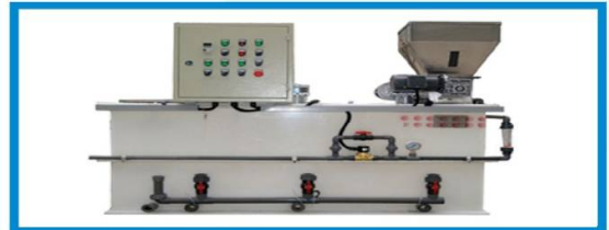
Automatic Chemical Dosing System