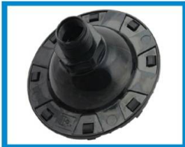
Coarse Bubble Air Diffuser