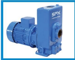
Effluent Transfer Pump