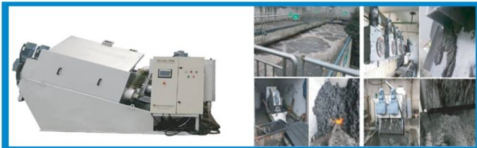
Sludge Dewatering Machine (Screw Type)