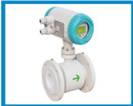
Electromagnetic Flow Meter