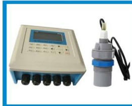
Ultrasonic Flow Meter