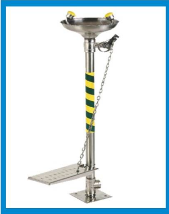
Eye/Face Wash Basin Model: LSE 02