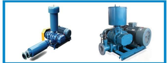
Positive Displacement Air Blower