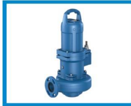
Submersible Sewage Pump