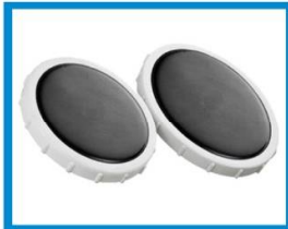
Fine Bubble Air Diffuser