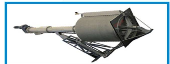
Automatic Drum Screener