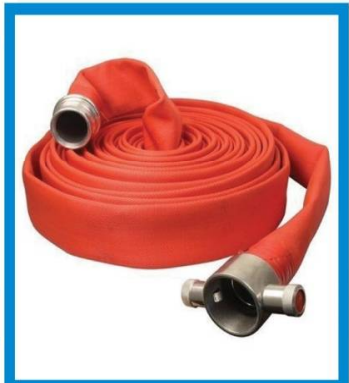
Synthetic Hose Pipe