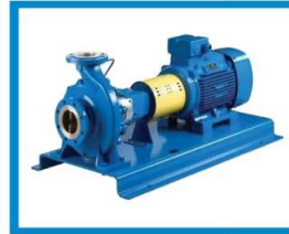
Filter Feed Pump