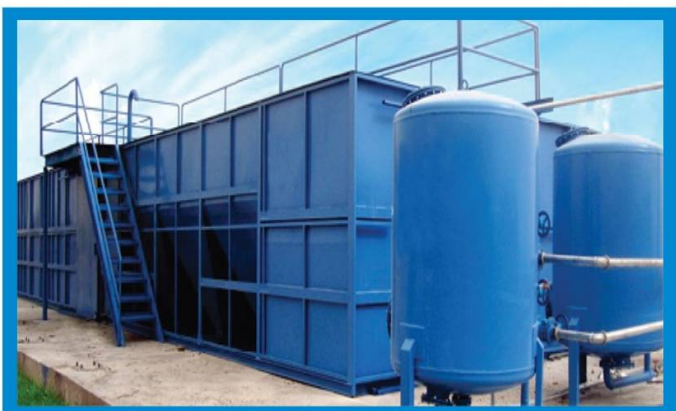
Integrated ETP & STP