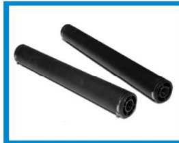
Tube Type Air Diffuser