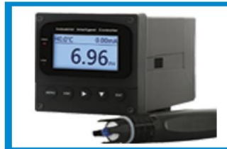
Online pH Controller